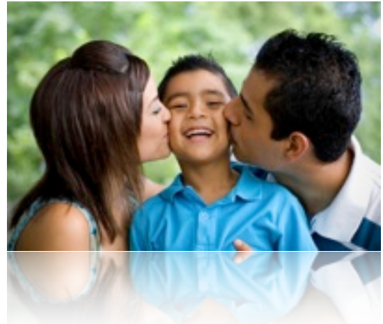
His Panic is Her Ethic ??????

Is it a switch from a male culture (production, quantity, speed) to a female culture (more integrative, respect for the timing of everything and concerned with preservation)? The whole BIO movement, (green, organic, natural) is a feminine movement.